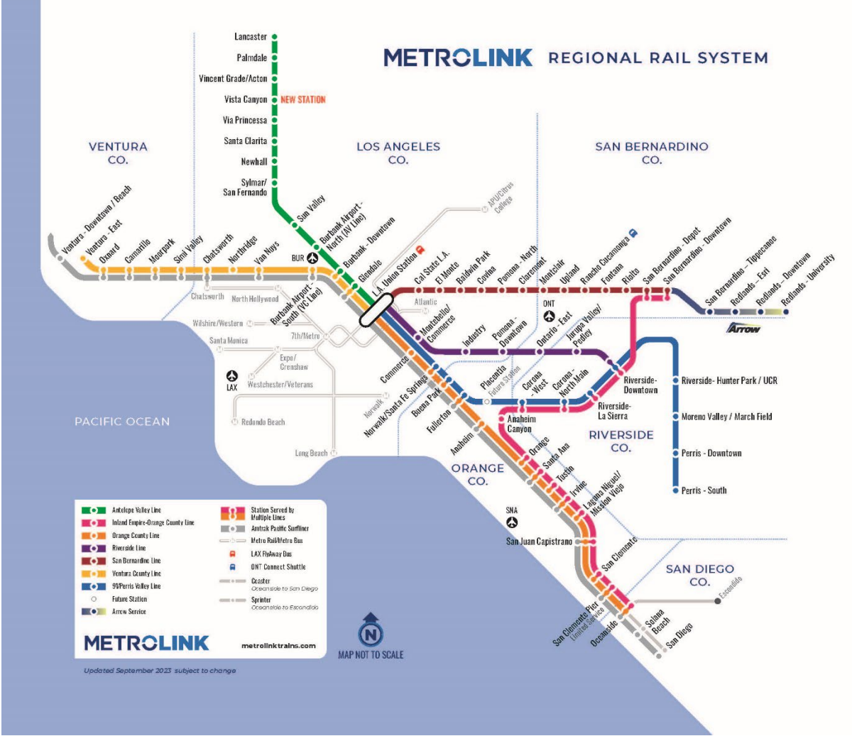
Figure 1 Metrolink Regional Rail System Map (2023)