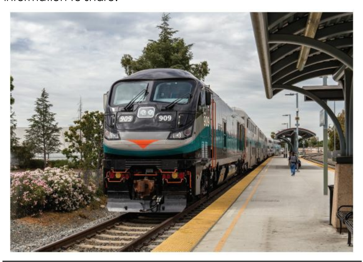
Metrolink COVID-19 (Coronavirus) Response:

Metrolink has found a software-based solution to help address the elevated noise coming from the F125 locomotive cooling fans during hotter summer temperatures. However, the software modification has caused unexpected faults in other interrelated systems. As a result, the modifications have been put on hold until staff can troubleshoot the issue and find the appropriate solution. Metrolink is working to resolve this issue as quickly as possible and will notify the community as soon as there is further information to share.