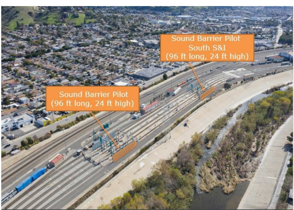
Central Maintenance Facility (CMF) Action Plan June 2021 Update