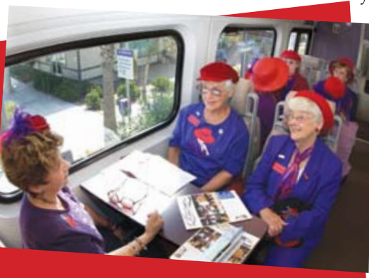
Even the Red Hat Ladies take Metrolink.

For more information on group-travel packages or to make reservations, please contact Metrolink at (800) 371-LINK (5465).