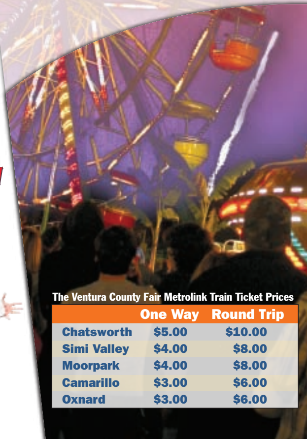
The Ventura County Fair Metrolink Train Ticket Prices

Metrolink Ventura County Fair train service is a special charter offered by the Ventura County Transportation Commission in cooperation with Seaside Park. A special ticket will be required to ride the trains, and can be purchased in advance Monday through Friday at the Whistle Stop Depot Café in the Chatsworth Metrolink station; Simi Valley, Moorpark, and Camarillo City Halls; or by calling (800) 438-1112. Tickets may also be purchased on the day of travel at the train stations on a first-come, first-served basis.