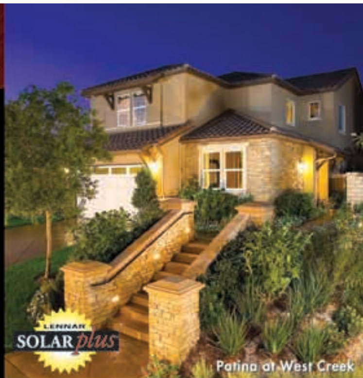
Patina at West Creek

Prices subject to change without notice. © 2008 Lennar Corporation. Lennar, the Lennar logo and SOLARplus SM are registered service marks or service marks of Lennar Corporation and/or its subsidiaries. 9/08