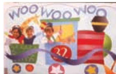
Metrolink's 2008 pin designers

In celebration of Metrolink's anniversary, there is a systemwide annual-pin distribution for passenger appreciation. Many of our longtime riders have already accumulated a collection of uniquely designed pins.