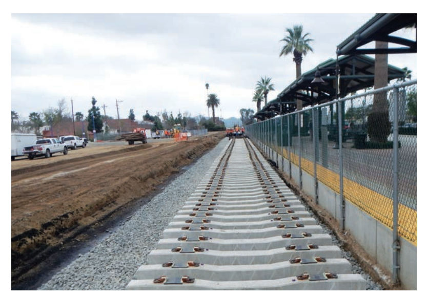
Concrete ties are ready for new steel rails at the Downtown Perris Station.

Throughout Riverside and Perris, construction crews are hard at work on new bridge construction, utility relocation, and building sound walls and street/rail crossings to make way for the 91 Line Extension to Perris, which is scheduled to open in late 2015. The 91 Line Extension to Perris represents the largest expansion of the Metrolink system in more than 20 years.