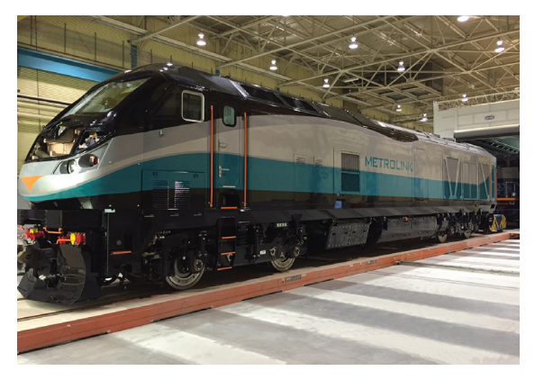
New Metrolink Tier 4 locomotives will be put into service in 2016.

We will also be changing our schedule. We realize we made some errors when we changed the schedule in October. Again, I am sorry. Please know that we've learned from those mistakes and are in the process of designing a schedule that we hope will be convenient for