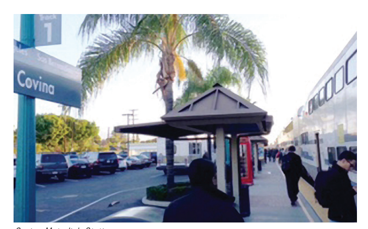
Covina Metrolink Station