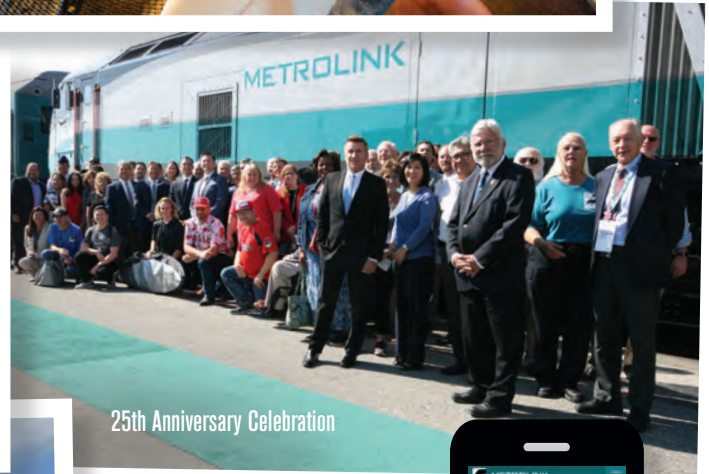
25th Anniversary Celebration