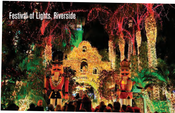
Festival of Lights, Riverside