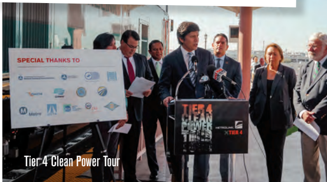
Tier 4 Clean Power Tour