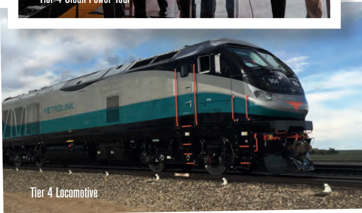
Tier 4 Locomotive