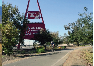
Santa Ana River Trail

R iders have many options when it comes to the first and last mile of each trip they take on Metrolink. This is the portion of their journey to and from the train station to their home or work. These options include driving, walking, bus riding or biking. Bikes are allowed on any Metrolink train car and each regular train car can hold three bikes. The special Bike/Board Cars are designed to hold six bikes on the lower level.