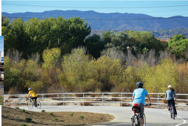
San Fernando Road Bike Path