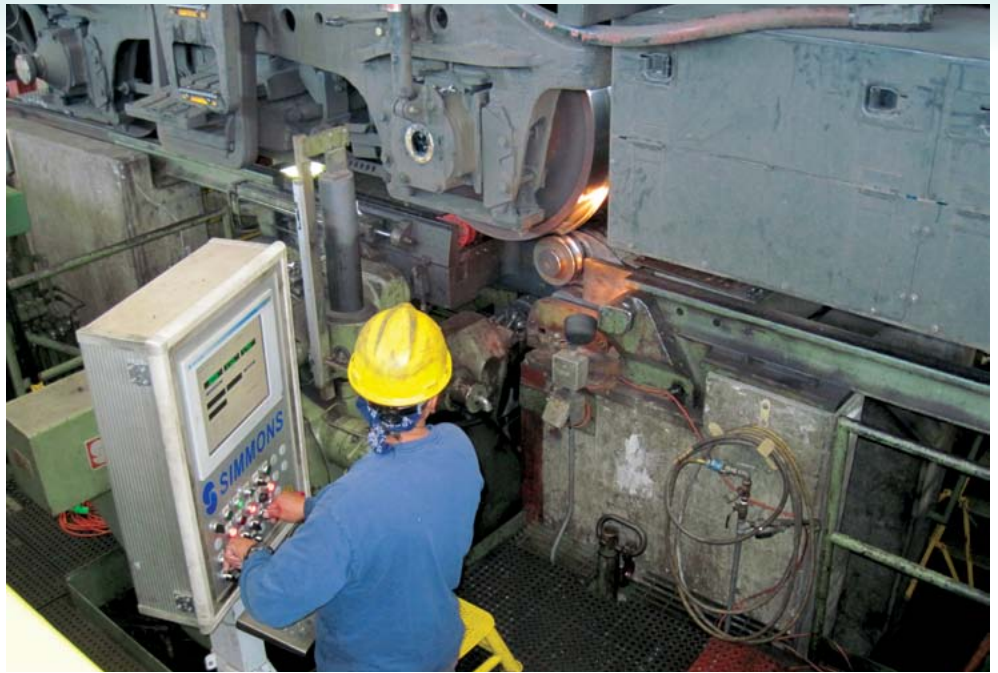
A mechanic operates a wheel-truing machine at Metrolink's Central Maintenance Facility in Los Angeles.

And it's the Equipment Department that oversees the purchase of new equipment like 117 new collision absorption-equipped railcars. Equipment Department staff traveled to Korea, where the cars were manufactured, to inspect them. When